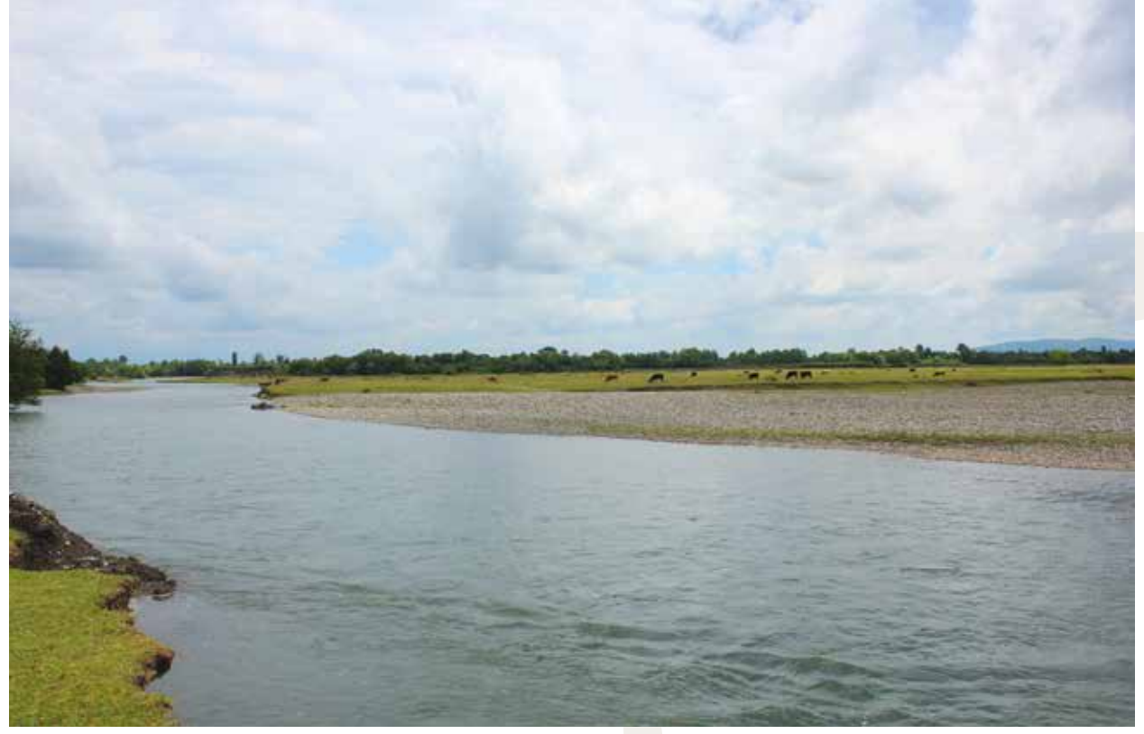
Ingur/i river