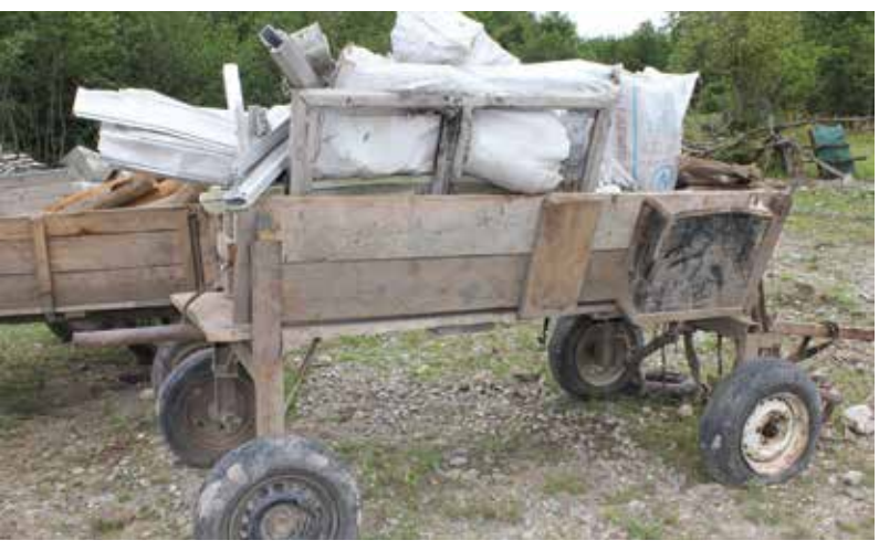
Cart with goods to be transported across the Ingur/i

no interaction with the Georgian part of their population and are suspicious or fearful of any ties with Georgia, insist that the number of crossing points be reduced to a minimum. Some would even like to see the border sealed entirely.<sup>11</sup> However, practice has shown that the reduction of official checkpoints tends to correlate with an increase in illegal crossings, something that all parties involved should be mindful of. According to the most recent declarations by the Abkhazian authorities, none of the current crossing points will be closed as long as there is no adequate infrastructure in place to enable people from more remote areas to travel easily to the main checkpoint. While this reduces the immediate problem, it does little to allay longer-term fears.