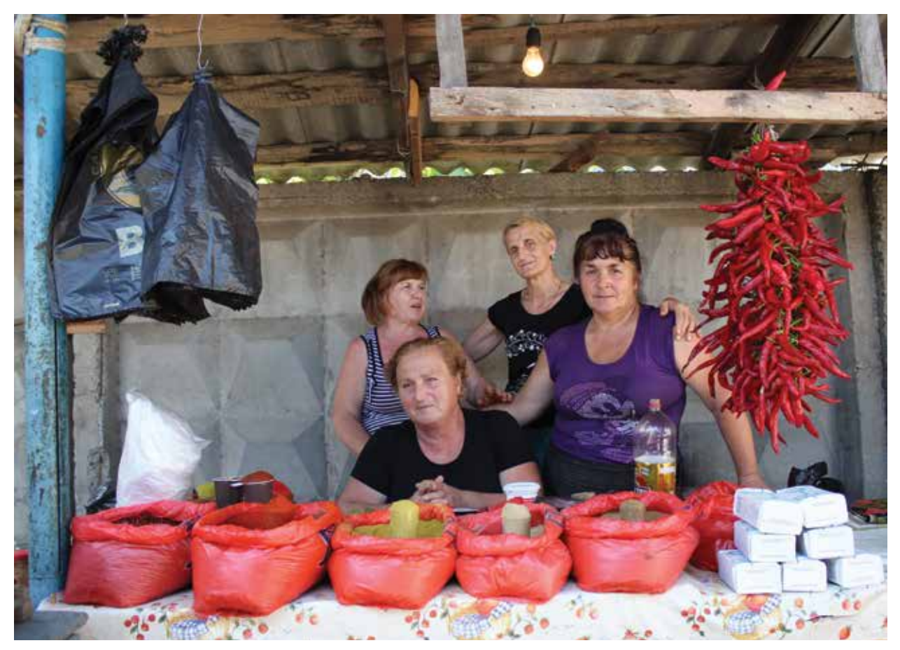
Stall at Gal/i market