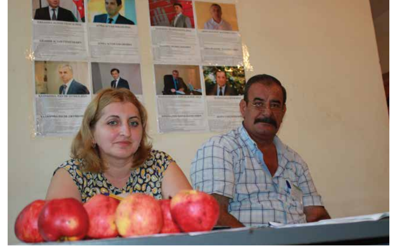
Polling station in Gal/i, 2014