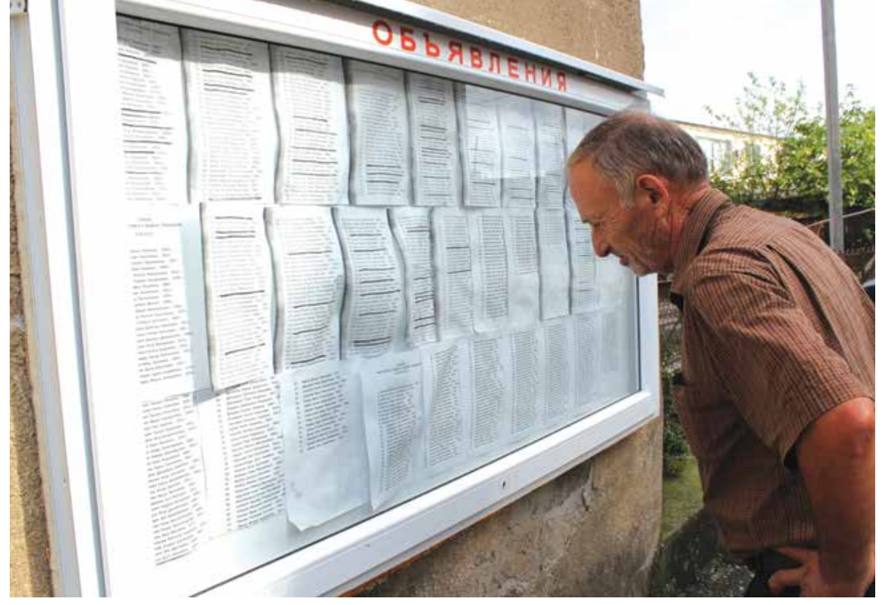
A Georgian checks whether his daughter-in-law was granted Abkhazian citizenship, outside the Gal/i passport office, 2012