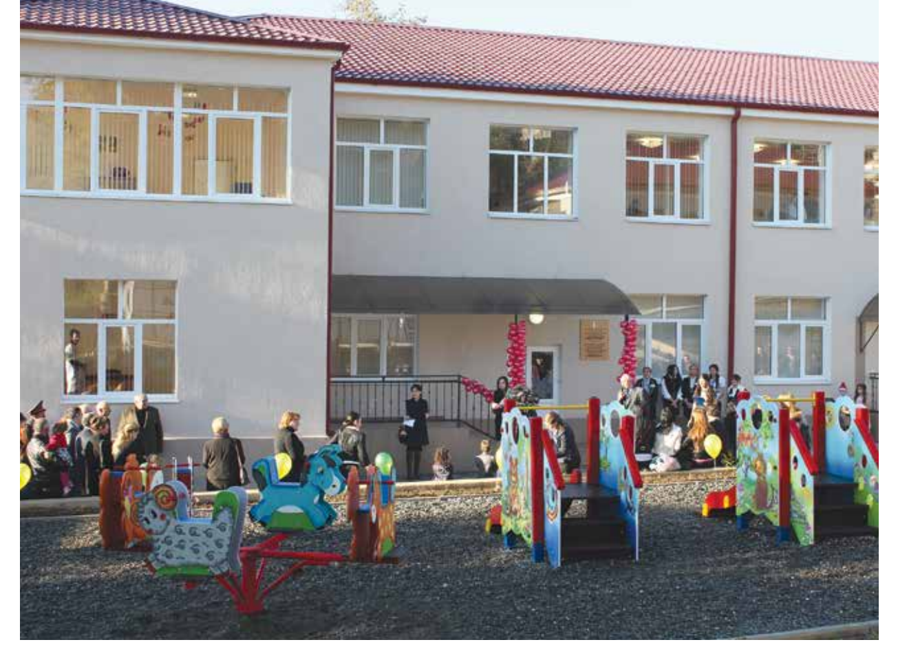
Opening ceremony at recently renovated kindergarden in Gal/i